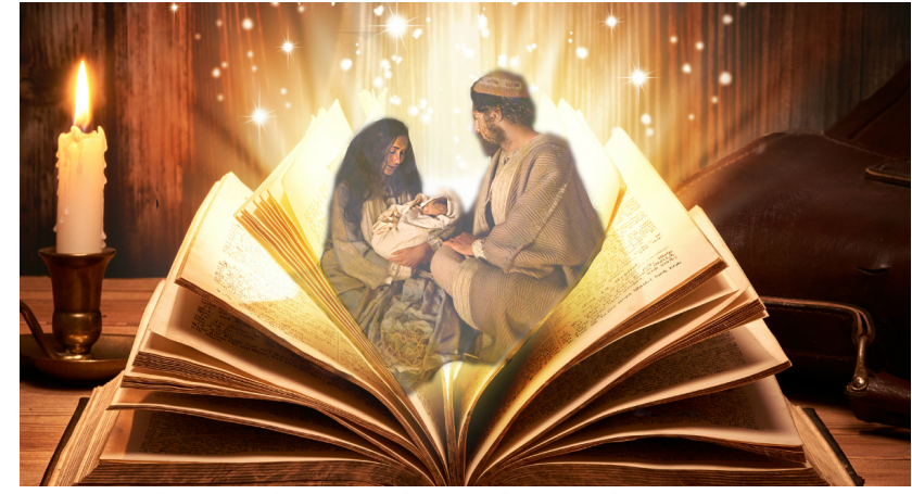
Twas the Night Before Christmas Beginning next Sabbath