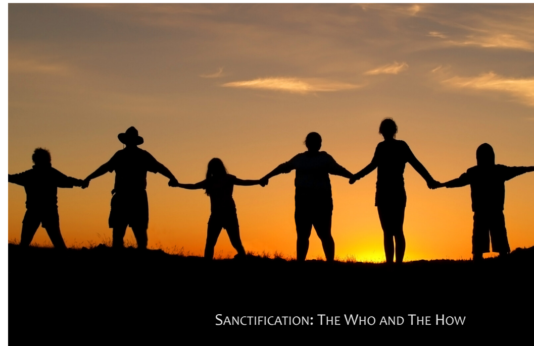
SANCTIFICATION: THE WHO AND THE HOW