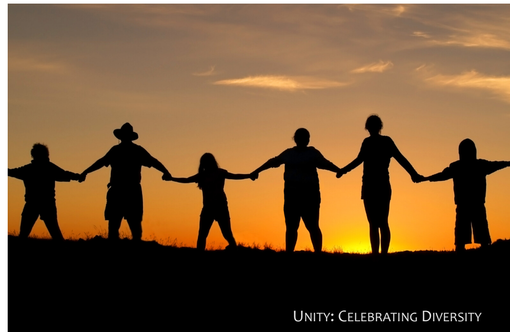
UNITY: CELEBRATING DIVERSITY